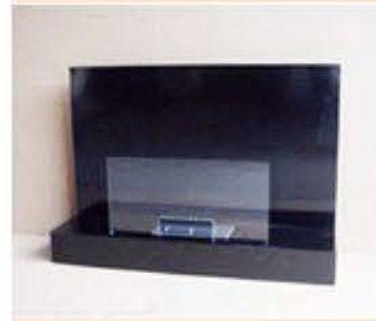
ECO - HC -101