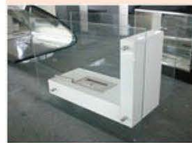
ECO - HC -103