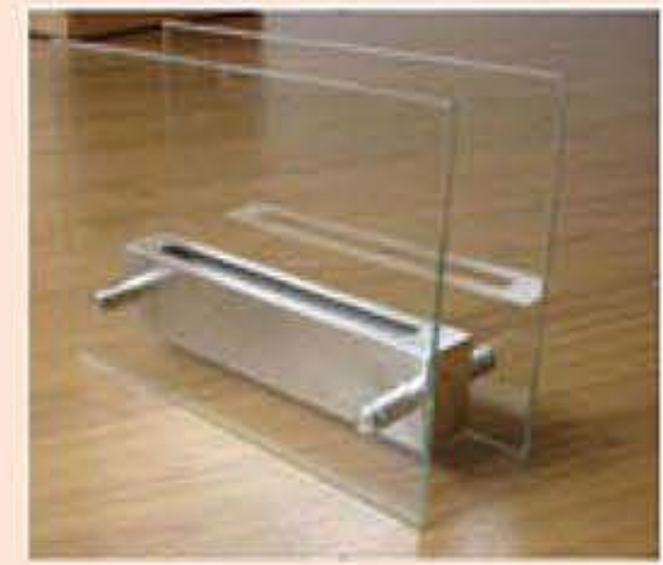
ECO - HC -102