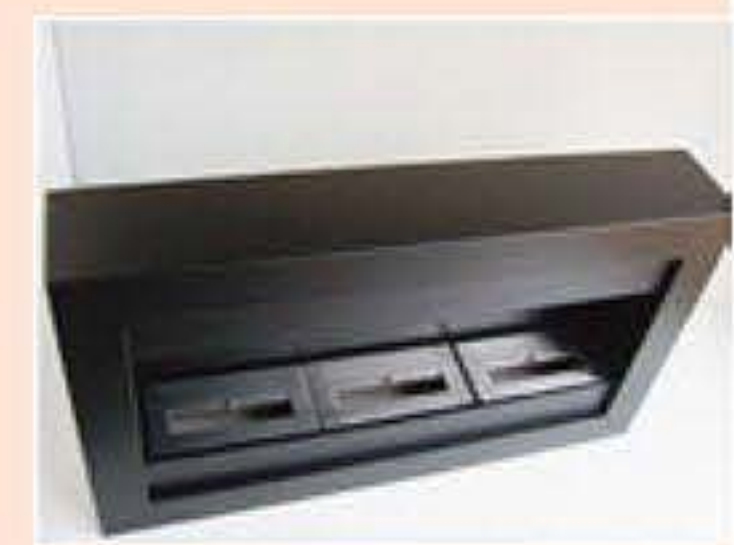
ECO - HC -104